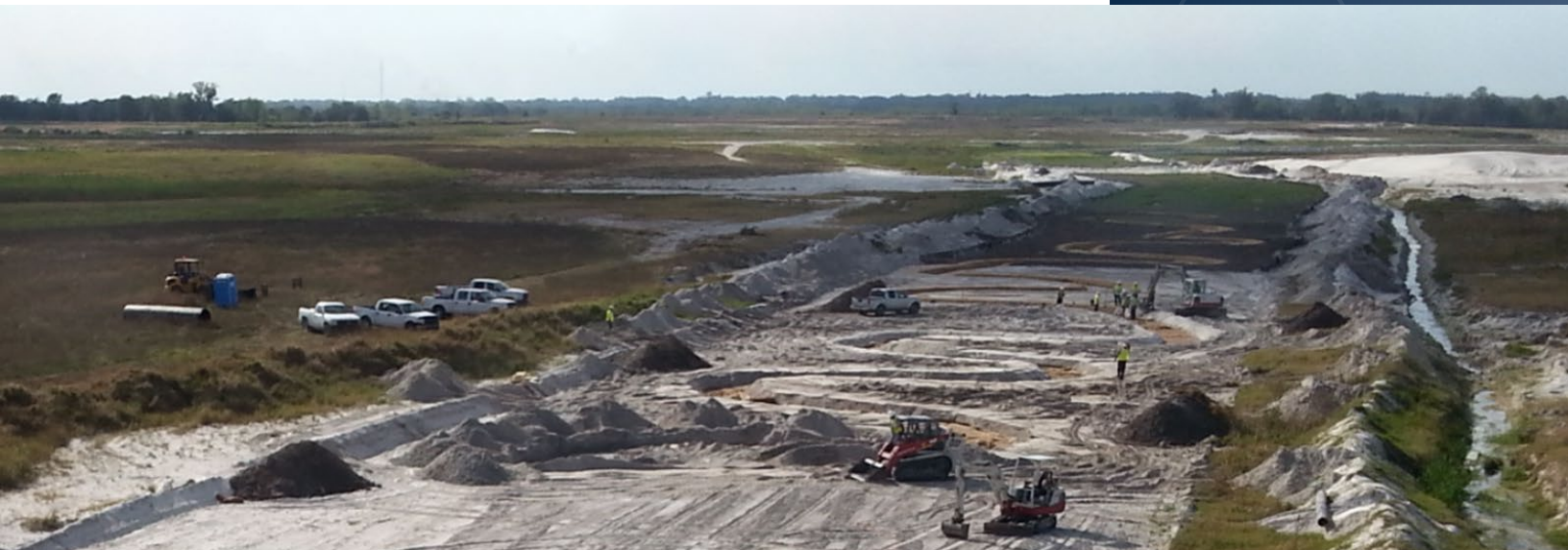
Image taken from Vanasse Hangen Brustlin, Inc Sensera Mosaic Stream Reclamation Site Camera located in Florida. VHB provides transportation planning and engineering, planning and design, land development, and environmental services.

SiteCloud Analytics now makes Sensera cameras even smarter by using AI and computer vision to automatically detect and summarize events of interest on the jobsite. SiteCloud Analytics addresses important use-cases to improve productivity, safety & risk, and site security. SiteCloud Analytics is based on world-class, best-of-breed solutions and is delivered as a turn-key end-to-end solution with the unparalleled ease-of-use and reliability that Sensera is known for.