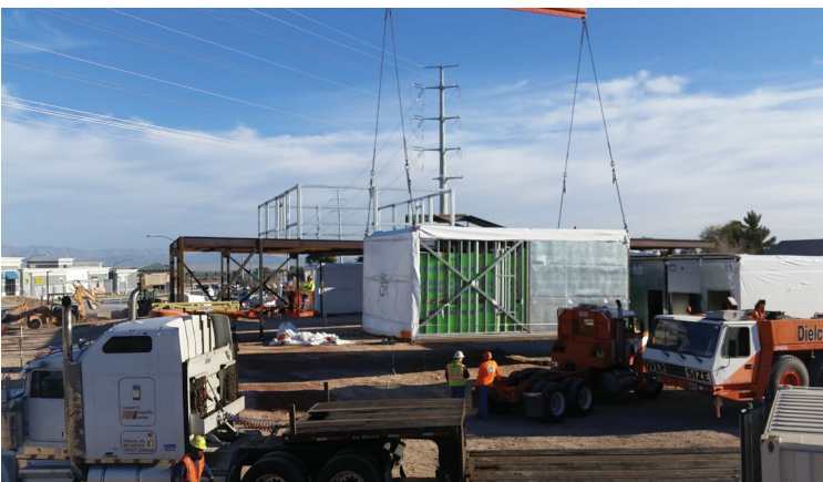
Photo of BLOX Built construction site

“ We were looking for a cost-effective construction camera solution for our fast-moving projects. We need to have cameras monitoring our projects from start to finish. From the production lines in our factory in Bessemer, AL to the numerous construction sites spread throughout the country, our team has the ability to monitor a project's progress in real-time even when we aren't on-site. ”