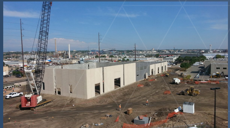
Photo of Denver Water development site